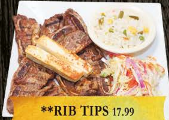
**RIB TIPS 17.99