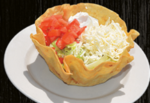
TACO SALAD JALISCO 13.99