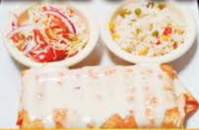
FRIED BURRITO 12.99