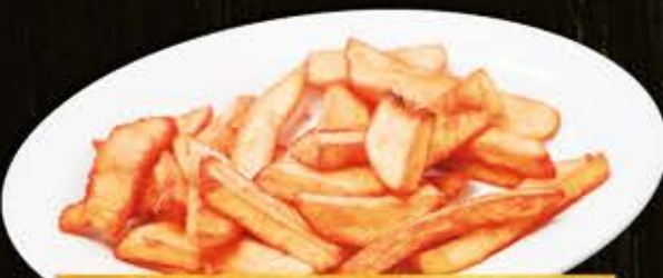
STEAK FRIES 2.99