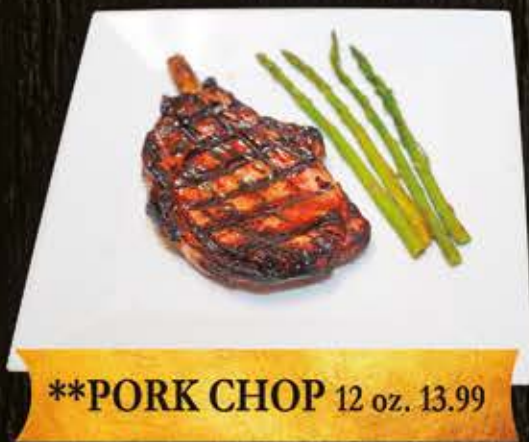
**PORK CHOP 12 oz. 13.99