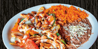
POLLO MEXICANO 12.99