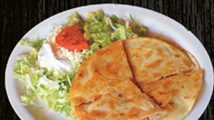
QUESADILLA FAJITA 12.99