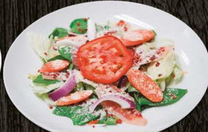
TOSS SALAD 8.99