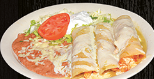
ENCHILADAS SUIZAS 12.99