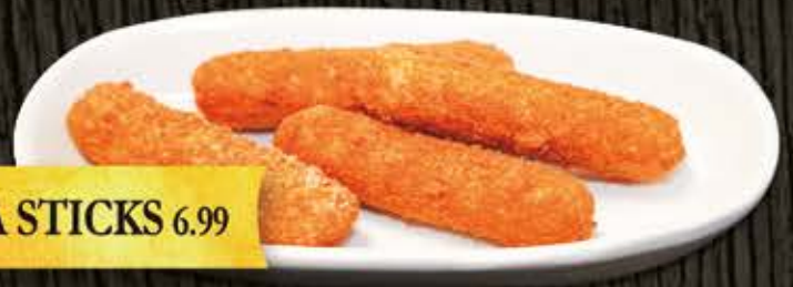
MOZZARELLA STICKS 6.99