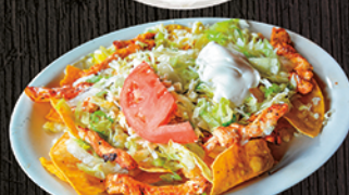
PAPA'S NACHOS 14.99