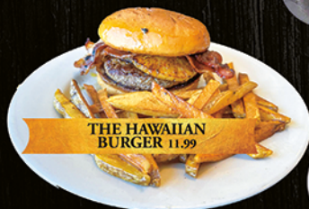
THE HAWAIIAN BURGER 11.99