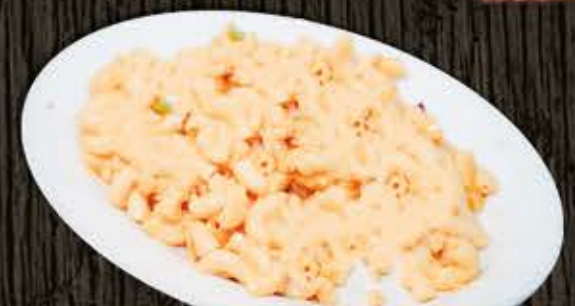
MACARONI AND CHEESE 2.99