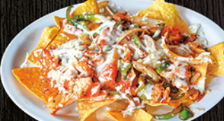
CHICKEN FAJITA NACHOS 13.99

*CONSUMING RAW OR UNDERCOOKED MEATS, POULTRY, SEAFOOD, SHELLFISH OR EGGS MAY INCREASE YOUR RISK OF FOODBORNE ILLNESS, ESPECIALLY IF YOU HAVE A MEDICAL CONDITION. PLEASE INFORM YOUR SERVER OF ANY FOOD ALLERGIES.