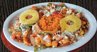
CAMARONES HAWAIANOS 14.99