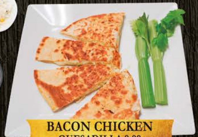
BACON CHICKEN QUESADILLA 9.99

*CONSUMING RAW OR UNDERCOOKED MEATS, POULTRY, SEAFOOD, SHELLFISH OR EGGS MAY INCREASE YOUR RISK OF FOODBORNE ILLNESS, ESPECIALLY IF YOU HAVE A MEDICAL CONDITION. PLEASE INFORM YOUR SERVER OF ANY FOOD ALLERGIES.