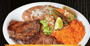
CARNE ASADA** 16.99