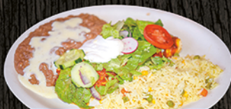
BURRITO JALISCO 11.99