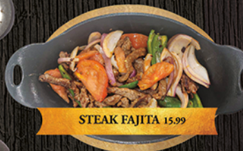
STEAK FAJITA 15.99