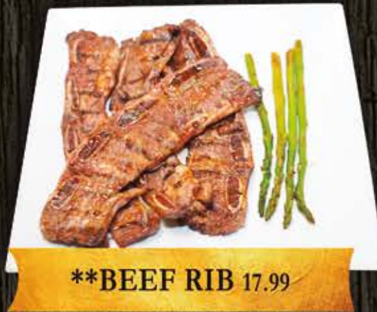
**BEEF RIB 17.99