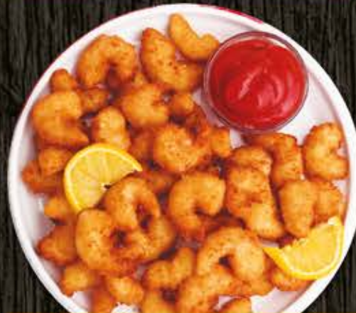
POPCORN SHRIMP 8.99