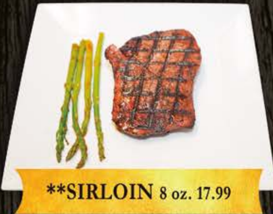
**SIRLOIN 8 oz. 17.99