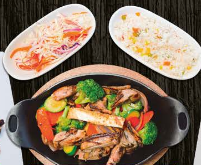
GRILLED CHICKEN BOAT 19.99