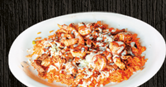
JALISCO ESPECIAL** 14.99