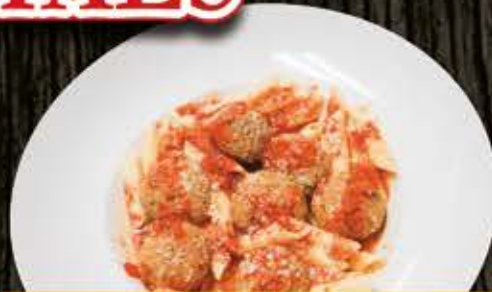
PASTA AND MEATBALLS 14.99