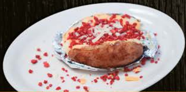
LOADED BAKED POTATO 3.99