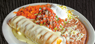
CHIMICHANGA FAJITA CHICKEN 12.25