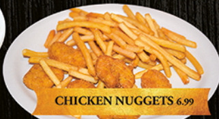
CHICKEN NUGGETS 6.99