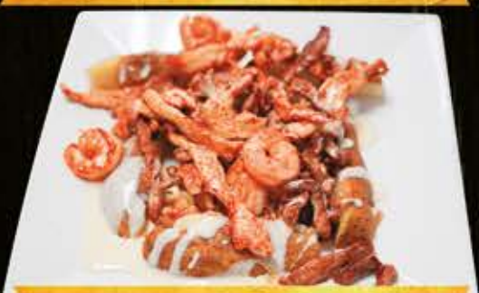
PAPA'S SPECIAL 16.99