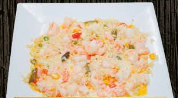
SHRIMP, RICE, AND CHEESE 15.99