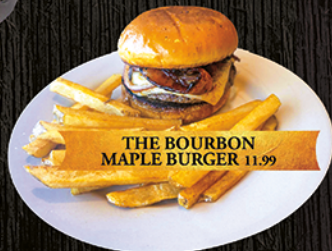
THE BOURBON MAPLE BURGER 11.99