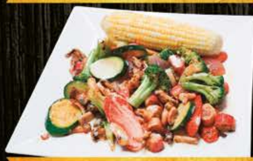
SEAFOOD MIX 19.99