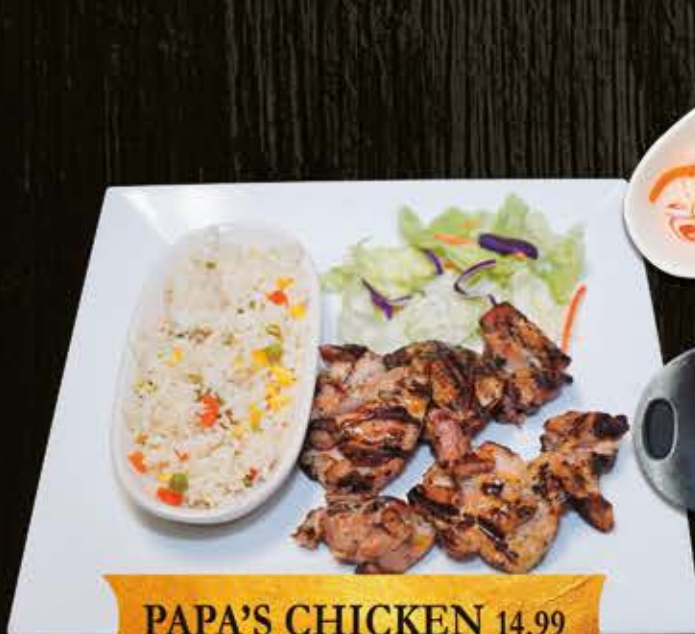
PAPA'S CHICKEN 14.99