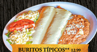
BURITOS TÍPICOS** 12.99