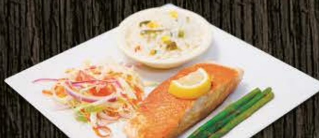
CITRUS SALMON 19.99