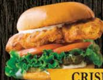
CRISPY CHICKEN SANDWICH 7.99