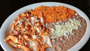
CHICKEN BANDIT 12.99