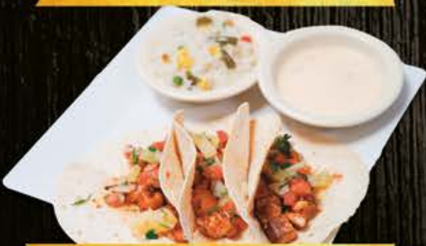
MAHI MAHI TACOS 15.99