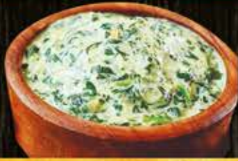
SPINACH CHEESE DIP 7.99