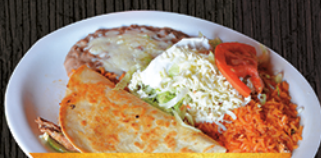
TEXAS QUESADILLA 12.99