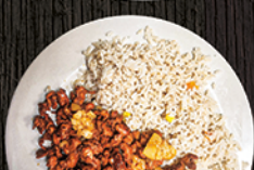
PASTOR PLATE 12.99