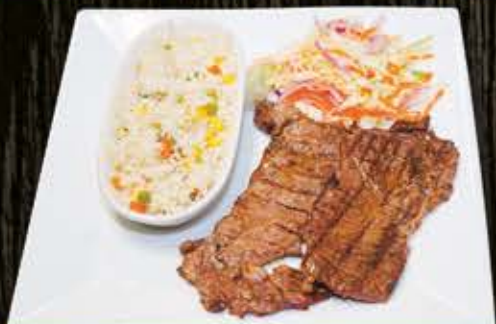
**CARNE ASADA 16.99