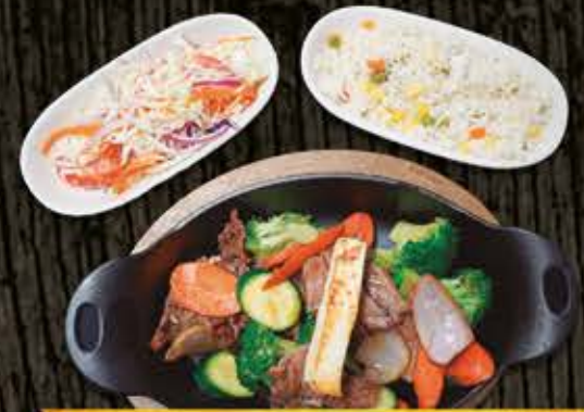
STEAK BOAT 19.99