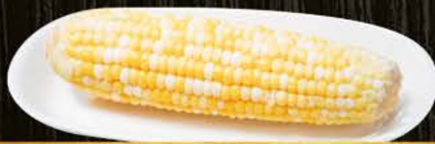
GRILLED CORN ON THE COB 2.99