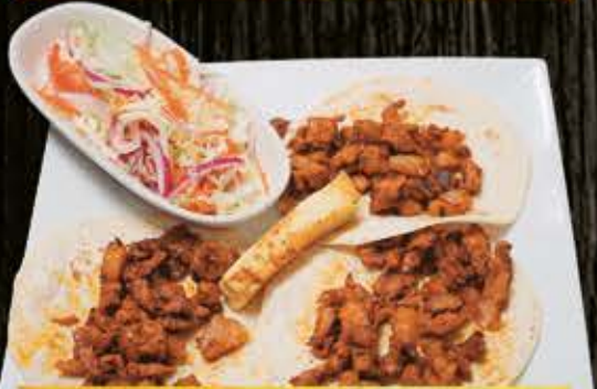
TACOS 15.99 Pastor | Steak | Chicken