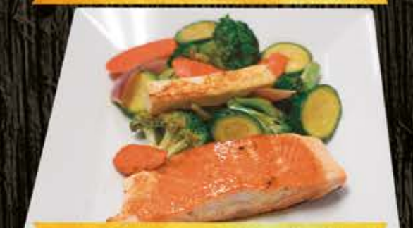
GRILLED SALMON 21.99