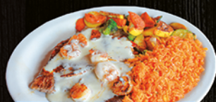
JALISCO STEAK** 19.99