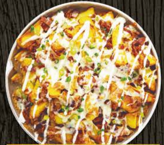
LOADED FRIES 13.99