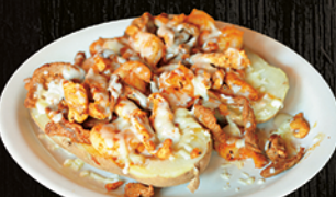
PAPA JALISCO 14.99