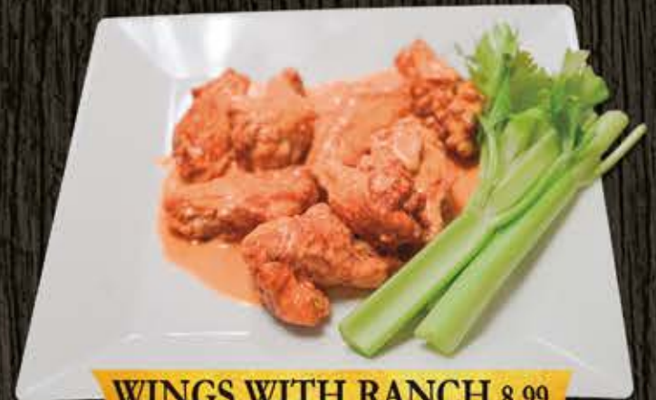
WINGS WITH RANCH 8.99 Chipotle | Buffalo | Mango