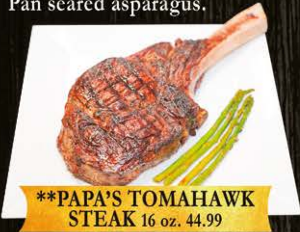
**PAPA'S TOMAHAWK STEAK 16 oz. 44.99