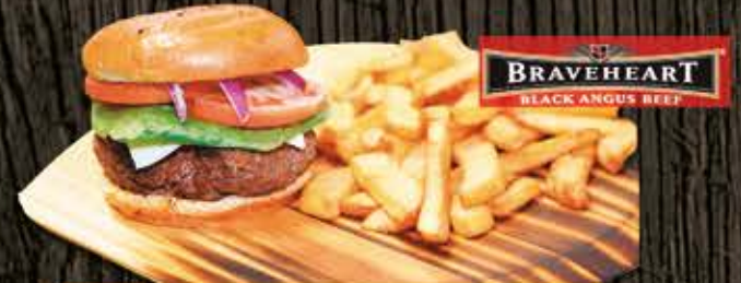
THE CLASSIC 11.99