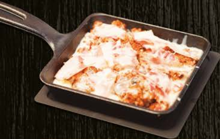
RANCHERO DIP 8.99