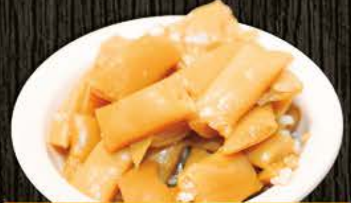
GREEN BEANS 2.99