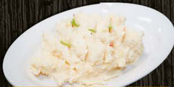
MASHED POTATOES 2.99