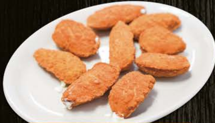
JALAPEÑO POPPERS 6.99