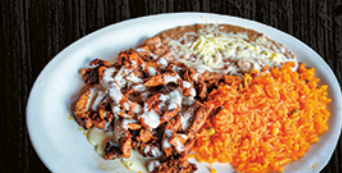
STEAK BANDIT 14.99