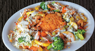
POLLO CALIFORNIA 14.99