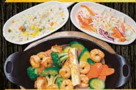
PAPA'S BOAT 21.99