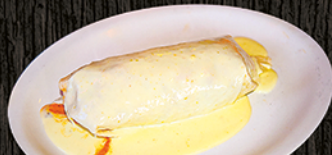
BIG MIXED BURRITO 12.99