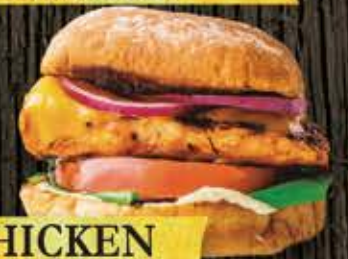
GRILLED CHICKEN SANDWICH 7.99