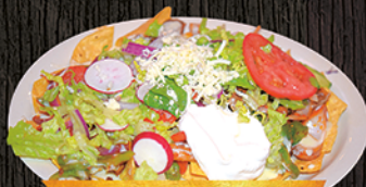
NACHOS JALISCO 14.99