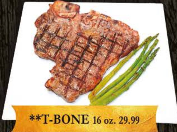
**T-BONE 16 oz. 29.99