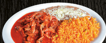
CHILE COLORADO** 14.99