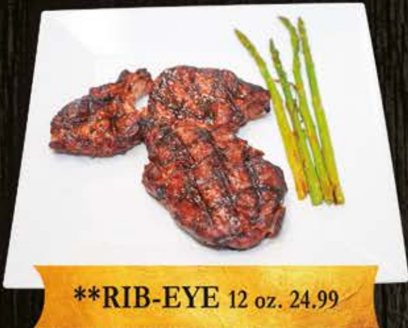
**RIB-EYE 12 oz. 24.99