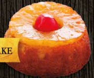
PINEAPPLE UPSIDE DOWN CAKE