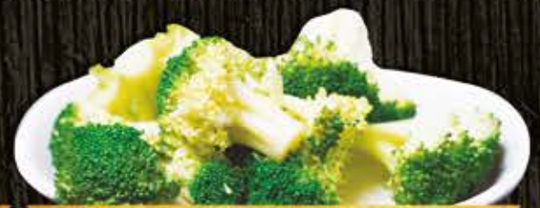
STEAMED BROCCOLI 2.99