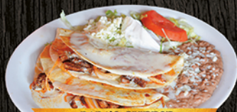
PAPA'S CHEESE STEAK OR CHICKEN** 14.99