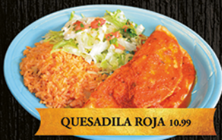
QUESADILLA ROJA 10.99