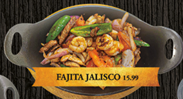
FAJITA JALISCO 15.99