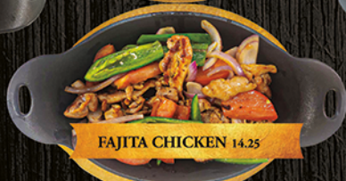
FAJITA CHICKEN 14.25