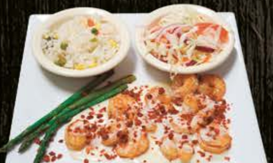
BACON SHRIMP 15.99