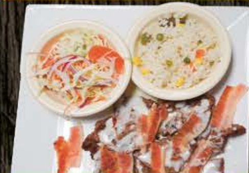
**CHEESE BACON STEAK 15.99