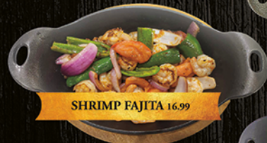
SHRIMP FAJITA 16.99